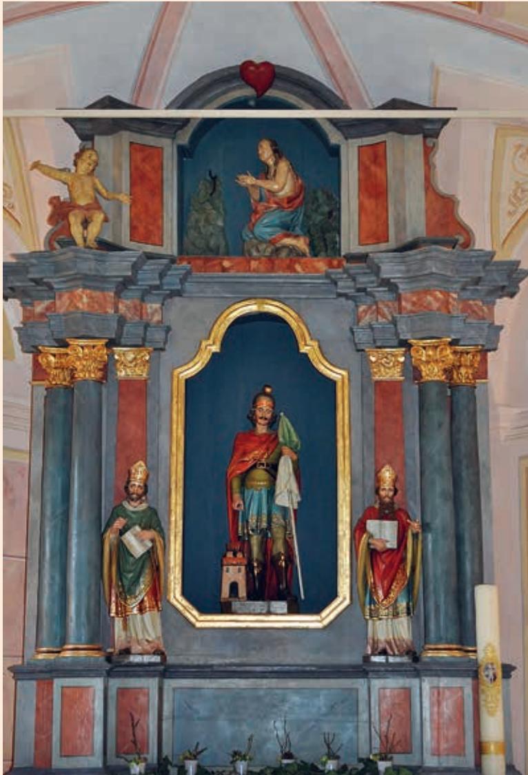
Klanjec, kapela sv. Florijana, glavni oltar, 1761.

Uspoređujući njezine opise s novosnimljenim fotografijama crkvenih interijera i pojedinačnih oltara, zaključeno je da se unutar dvadesetak godina dogodila opsežna devastacija sakralnog inventara, o čemu smo u suautorstvu priredile izlaganje na 1. kongresu hrvatskih povjesničara umjetnosti , održanu 2002. godine, koje je objavljeno 2004. u zborniku kongresa pod naslovom Recentna devastacija baroknog sakralnog inventara na području Hrvatskog zagorja . Publikacija Umjetnička topografija Krapinsko-zagorske županije objavljena je 2008. godine i u njoj su dostupni podaci o stanju na terenu početkom 2000-ih.