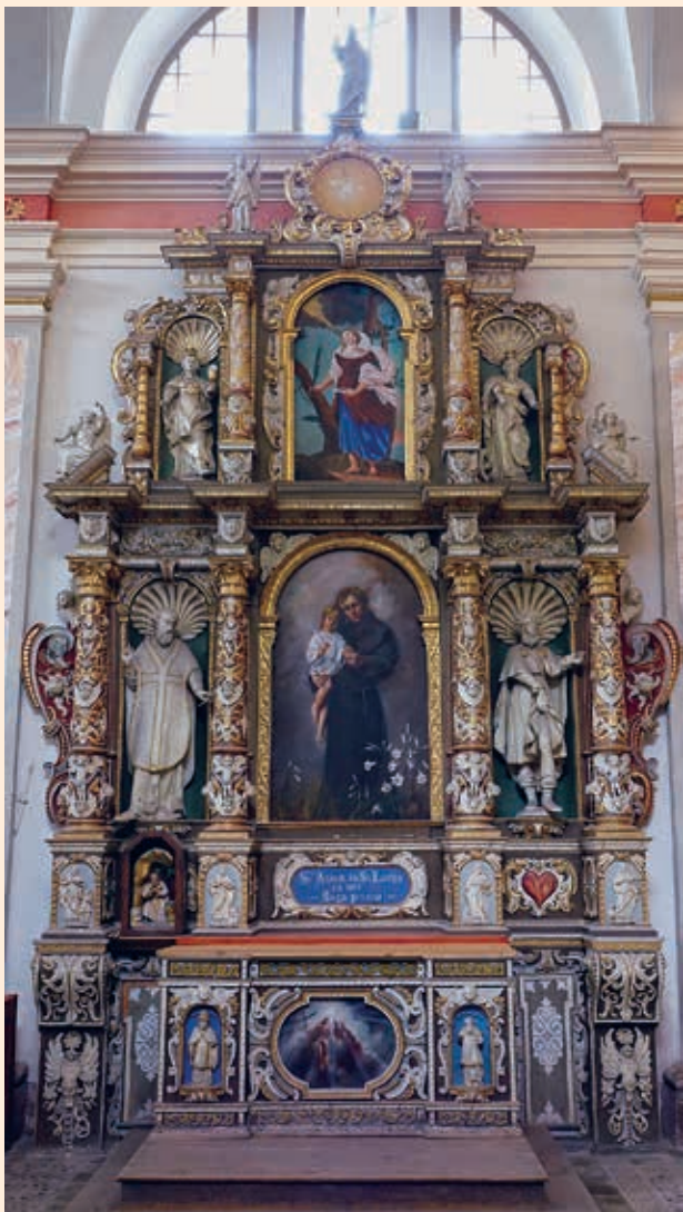
Vrhnika, crkva Presvetog Trojstva, oltar sv. Antuna Padovanskoga, 1654. -1659.