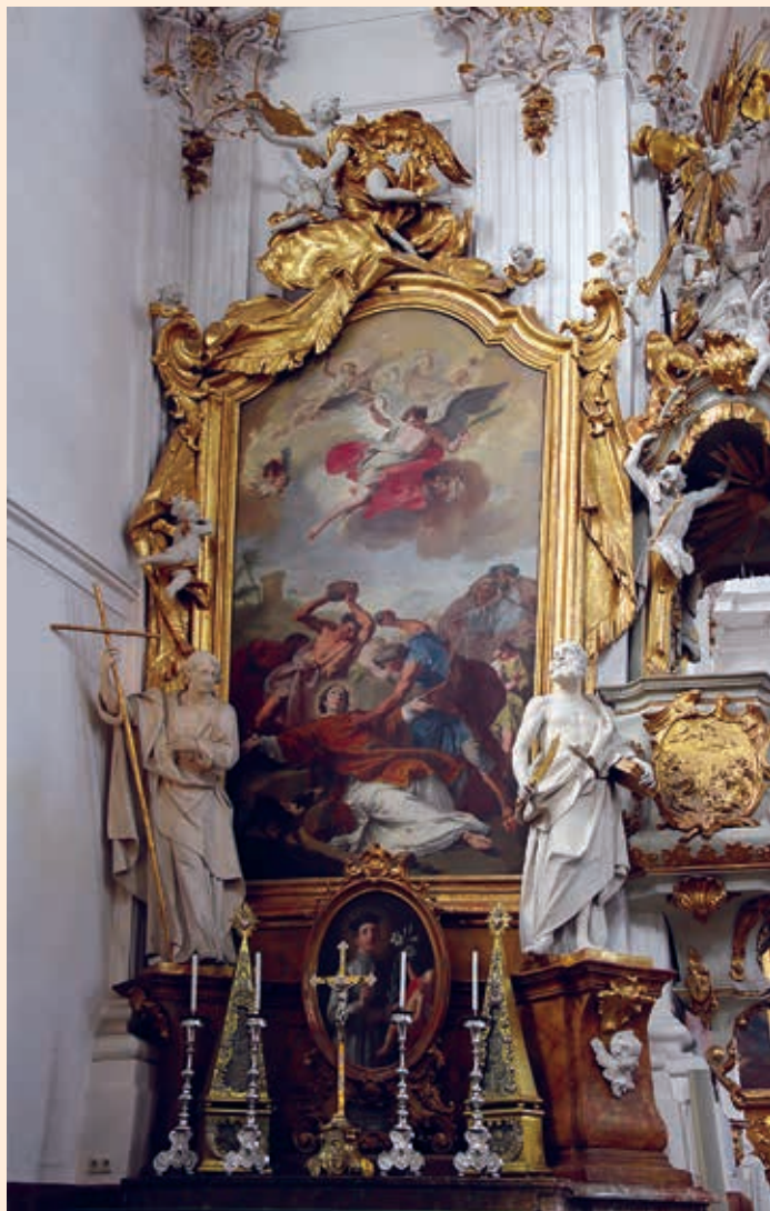
Dießen am Ammersee, crkva Uznesenja Blažene Djevice Marije, oltar sv. Stjepana, 1738. – 1740.