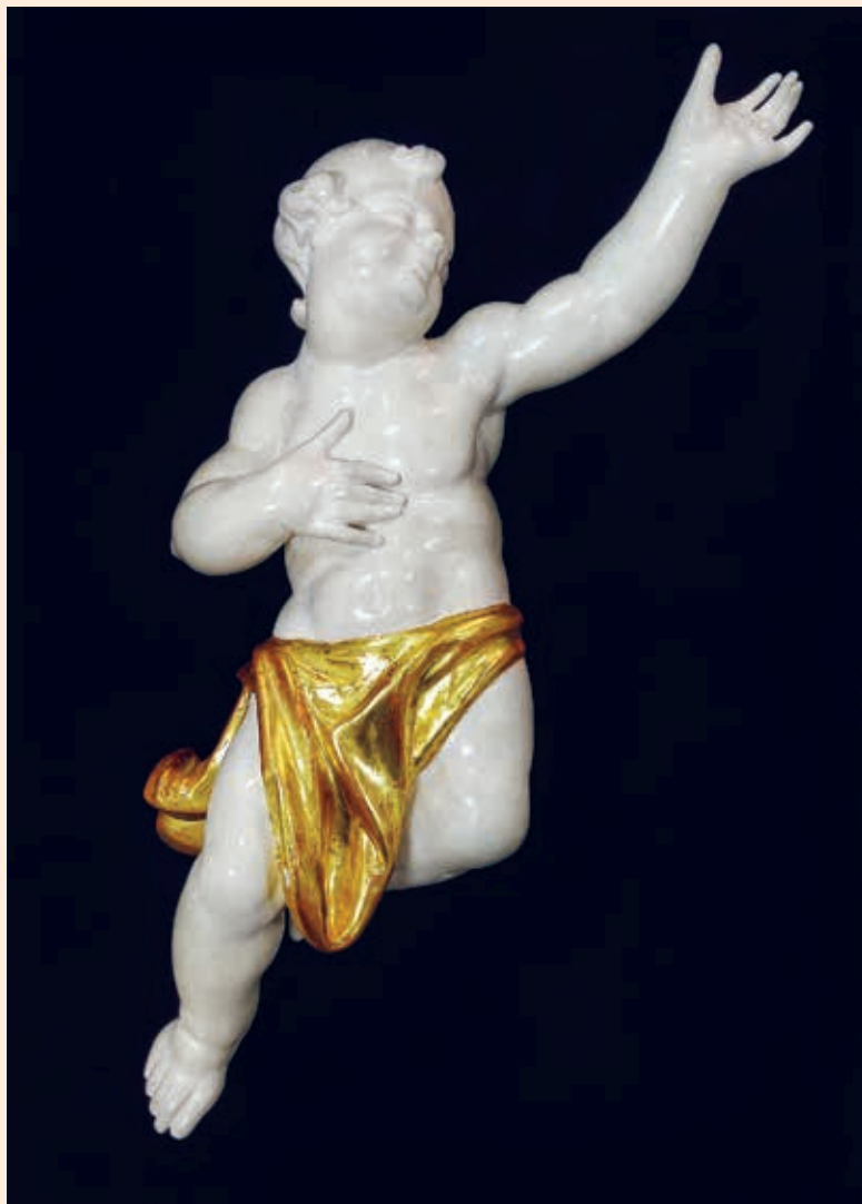
Andeo s oltara crkve svetih Petra i Pavla u Osijeku, oko 1766., Osijek, Muzej Slavonije