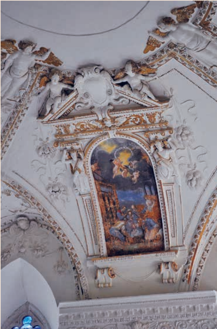
Sopronkeresztúr (Deutschkreuz), kapela dvorca Nádasdy, štuko-dekoracije, 1640-te; snimio: Ferenc Veress