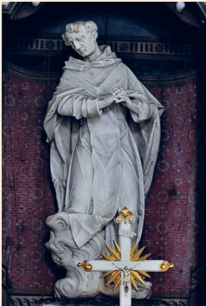
Bl. Augustin Kažotić s nekadašnjeg oltara sv. Jurja u zagrebačkoj katedrali, 1746. –1749. Lupoglav, crkva bl. Augustina Kažotića