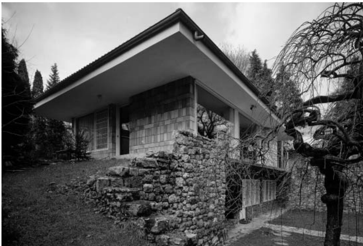
Vila Cuvaj / Villa Cuvaj , Zagreb, Zamenhoffova 17, 1937.

otvor kako nad gradom pada snijeg ili kada cvate drveće. S toga razloga, psihološkog i higijenskog, mi pravimo velike staklene stijene , da u bogatstvo ugodnosti stana dobijemo i svu raznolikiju ljepotu prirode. Dobro izvedeni prozori brane nas od zime, kiše i vjetra a omogućuju nam sunce, svjež zrak i veliki horizont. Ne zaklanjamo se od prirode sa malenim okancima. Ne bojimo se nevremena. Letimo u avionu.