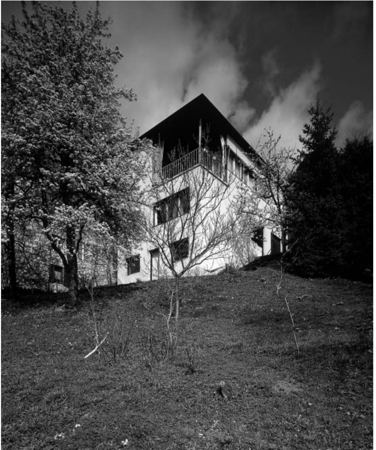
Vila Stahuljak / Villa Stahuljak , Zagreb, Goljak 41, 1936.