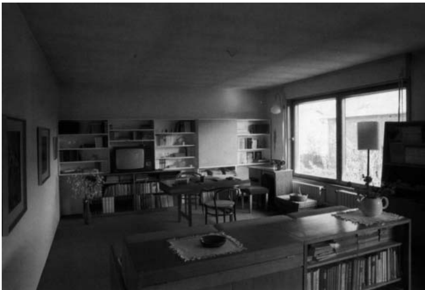
Obiteljska kuća Braim / Braim single-family house, Velika Gorica, Kralja Stjepana Držislava 21, 1979.

kojemu se ne smije ni sjediti, ni hodati i nema više velikih kuhinja u kojima se uglavnom stanovalo i jelo. Za modernu domaćicu dostatna je mala ispravno dimenzionirana kuhinja sa svim potrebnim, praktično organiziranim predmetima. U jednom redu ormar, stol, praonik, brzogrijalica i plinski štednjak. Za priredbu ručka na plinu dostatno je jedan sat. Ostali dio dana proborave ukućani u velikoj dnevnoj sobi , a ta neka ima sunca i zraka i neka je spojena direktno sa vrtom ili terasom. U bogatijim slučajevima odjeljuje se staklenom stijenom, zastorom ili vitrinom jedan dio za blagovaonu (radi mirisa i prostiranja) ili dio sa finijim pokućstvom, knjižnicom, vitrinama kao neka familijarna vrijednost, reprezentacija.