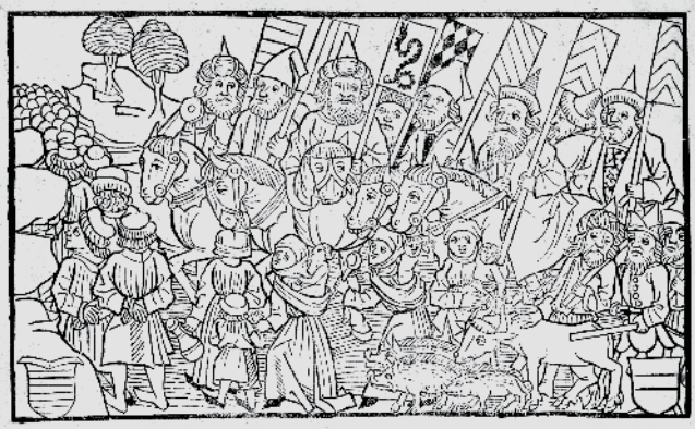
3. Conquest of the Carpathian Basin , Johannes de Thurocz, Chronica Hungarorum , Brno, 1488, Budapest, National Széchényi Library, Inc. 668

Osvajanje Karpatskog bazena, Johannes de Thurocz, Chronica Hungarorum , Brno, 1488., Budimpešta, Nacionalna knjižnica Széchényi, Inc. 668