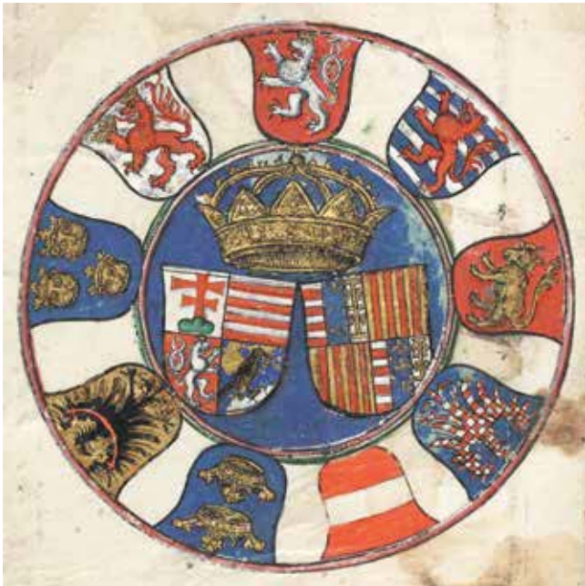
10. Circle of coats of arms, Johannes de Thurocz, Chronica Hungarorum , Augsburg, 1488, Budapest, National Széchényi Library, Inc. 1145b

Kralj Matija, Johannes de Thurocz, Chronica Hungarorum , njemački prijevod, kasno 15 st., Heidelberg, Sveučilišna knjižnica, Cod. Pal. Germ. 156, fol. 164r