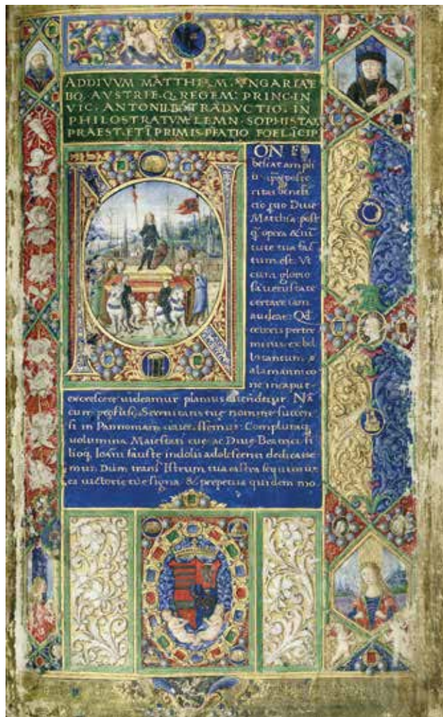
1. Philostratus-corvina , Budapest, National Széchényi Library, Cod. Lat. 417, fol. 2r Philostratus-corvina , Budimpešta, Nacionalna knjižnica Széchényi, Cod. Lat. 417, fol. 2r

In 1476, after stabilising his power, Matthias married an Italian princess, Beatrix of Aragon; however, they had no children. Thus, from around 1485 the aging king tried to ensure the right of his illegitimate son, Johannes, born to an Austrian girl, to the throne. Recognizing the potential of art patronage in the representation of power and propaganda, Matthias, one of the first renaissance patrons of artists and humanist scholars north of the Alps, relied on the agency of both words and images when promoting his son. Although the legend of the Corvinus family was not his own initiative, he took advantage of the possibilities inherent in it, claiming that Johannes, named Corvinus , was the descendent of an ancient noble family originating in Rome. In addition to