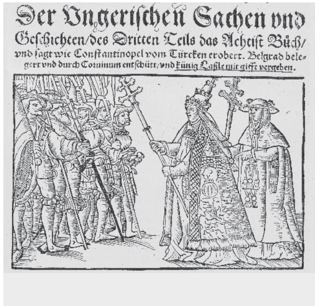
17. Pope Nicolaus V pronouncing remission of sins to soldiers, Bonfini, Des aller mechtigsten Königreichs inn Ungern warhafftige Chronick und Anzeigung , Basel, 1545, Budapest, National Széchényi Library, App. H. 1734

Finally, we must consider the first known illustrated copy of Bonfini's Rerum ungaricarum decades , its 1545 Basel edition. It seems very likely that there was no previous tradition the illustrators of this book could follow. They were free to devise a completely new cycle of images, and they did a good job.