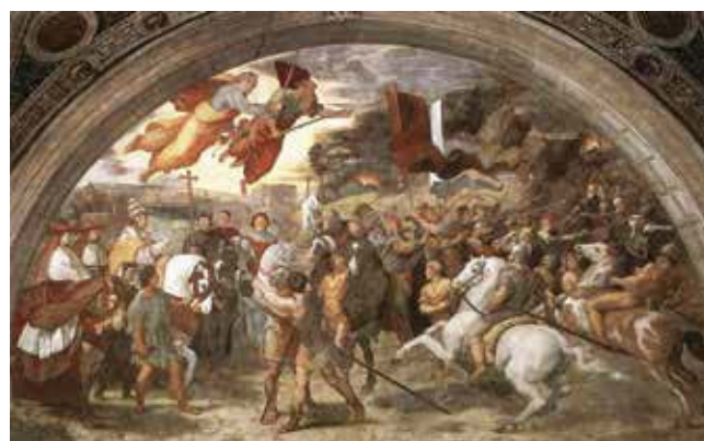
15. Raffaello Sanzio, Encounter of Attila and Pope Leo the Great , Rome, Vatican Museum, Raphael Rooms, Room of Heliodorus (Stanze di Raffaello, Stanza di Eliodoro)

Rafaël Sanzio, Susret Atile i pape Leona Velikog, Rim, Vatikanski muzeji, Rafaelove sobe, Heliodorova soba