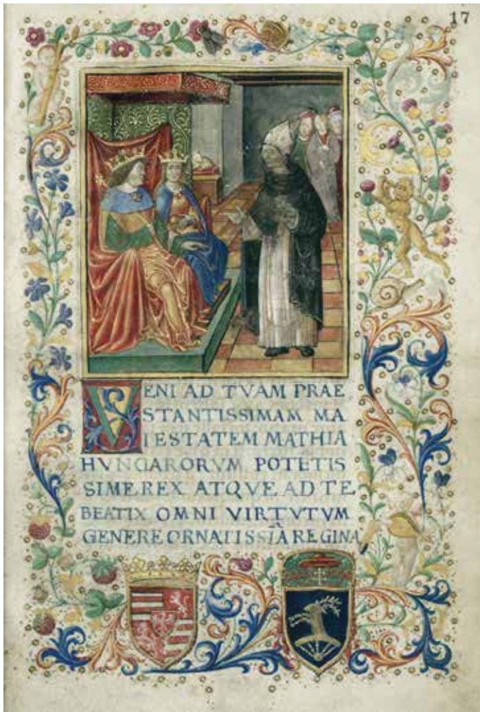
2. Ransano's speech before Matthias and Beatrix, Ransanus-corvina, Budapest, National Széchényi Library, Cod. Lat. 249, fol. 17r Ransanov govor pred Matijom i Beatrix, Ransanus-corvina, Budimpešta, Nacionalna knjižnica Széchényi, Cod. Lat. 249, fol. 17r

neither Johannes Corvinus nor Queen Beatrix succeeded in their ambitions. It was not the Habsburgs who gained power either. Instead, Ladislaus of the House of Jagiellon (+1516) was elected and crowned King of Hungary. 7