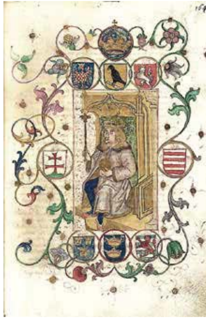
12. King Matthias, Johannes de Thurocz, Chronica Hungarorum , German translation, late 15 th century, Heidelberg, Heidelberg Universitätsbibliothek, Cod. Pal. Germ. 156, fol. 164r

rior (Fig. 9). Heraldic signs constitute an important part of the image program too. The first image of the first opening consists of a circle of coats of arms, a symbolic allusion to the lands Matthias had (or claimed to have) a right to. Merchants, of course, always knew the tastes and expectations of their