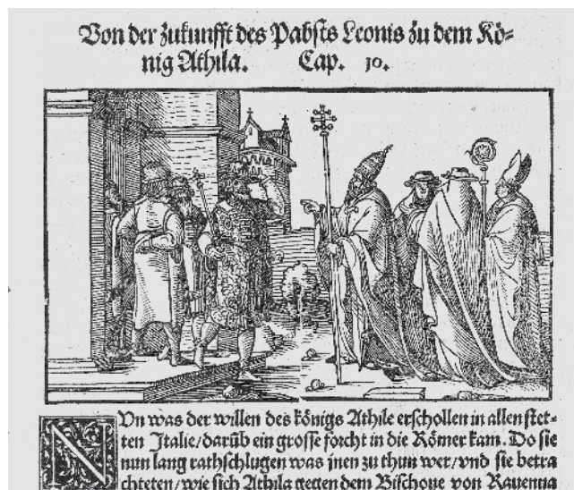
14. Encounter of Attila and Pope Leo the Great. Johannes de Thurocz, Chronica Hungarorum , German translation: Der hungern Chronica , Nuremberg, 1534, Budapest, National Széchényi Library, App. H. 1691 Susret Atile i pape Leona Velikog, Johannes de Thurocz , Chronica Hungarorum , njemački prijevod: Der hungern Chronica , Nuremberg, 1534, Budimpešta, Nacionalna knjižnica Széchényi, App. H. 1691

The image program in the Heidelberg copy of the Chronica Hungarorum closely follows that of the Brno edition; however, some of the portraits were painted after the woodcuts of the Augsburg edition. 31 That the images were selected and compiled from two books is a sign of careful editorial work. Those who were in charge of making the Heidelberg copy were also aware of the significance of heraldic elements. The portrait of Matthias is surrounded by a number of coats of arms (Fig. 12). They are very similar to those contained in the opening image of the Augsburg edition, but there are some telling differences. While the "Heidelberg copyist" (perhaps someone in Bavaria) had no problem with the association of