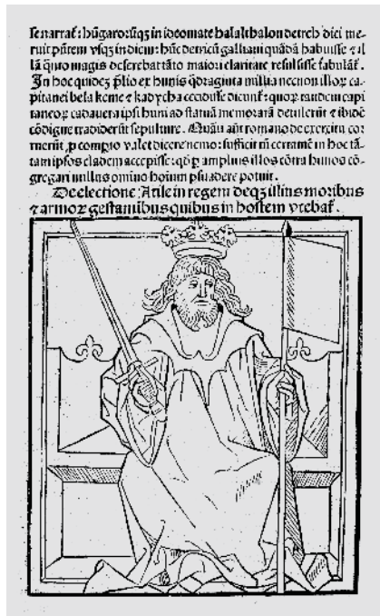
4. Attila, Johannes de Thurocz, Chronica Hungarorum , Brno, 1488, Budapest, National Széchényi Library, Inc. 668 Atila, Johannes de Thurocz, Chronica Hungarorum, Brno, 1488., Budimpešta, Nacionalna knjižnica Széchényi, Inc. 668