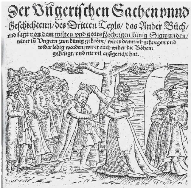
16. Queen Maria offers the royal insignia to King Sigismund, Bonfini, Des aller mechtigsten Königreichs inn Ungern warhafftige Chronick und Anzeigung , Basel, 1545, Budapest, National Széchényi Library, App. H. 1734

Kraljica Marija pruža kraljevske insignije kralju Sigismundu, Bonfini, Des aller mechtigsten Königreichs inn Ungern warhafftige Chronick und Anzeigung , Basel, 1545., Budimpešta, Nacionalna knjižnica Széchényi, App. H. 1734