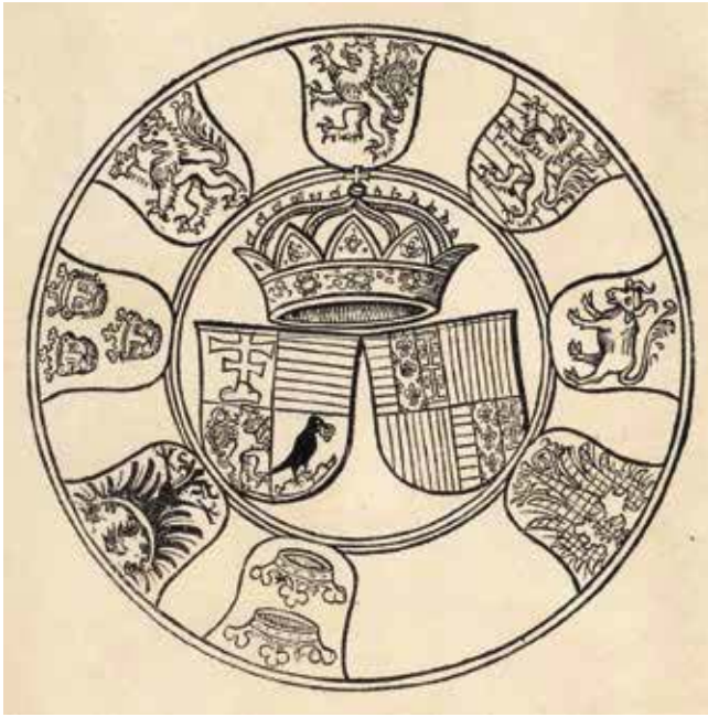
10. Circle of coats of arms, Johannes de Thurocz, Chronica Hungarorum , Augsburg, 1488, Budapest, National Széchényi Library, Inc. 1145b

Krug s grbovima, Johannes de Thurocz, Chronica Hungarorum , Augsburg, 1488., Budimpešta, Nacionalna knjižnica Széchényi, Inc. 1145b