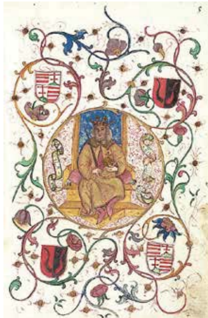
13. Attila, Johannes de Thurocz, Chronica Hungarorum , German translation, late 15 th century, Heidelberg, Universitätsbibliothek, Cod. Pal. Germ. 156, fol. 5r

rior (Fig. 9). Heraldic signs constitute an important part of the image program too. The first image of the first opening consists of a circle of coats of arms, a symbolic allusion to the lands Matthias had (or claimed to have) a right to. Merchants, of course, always knew the tastes and expectations of their