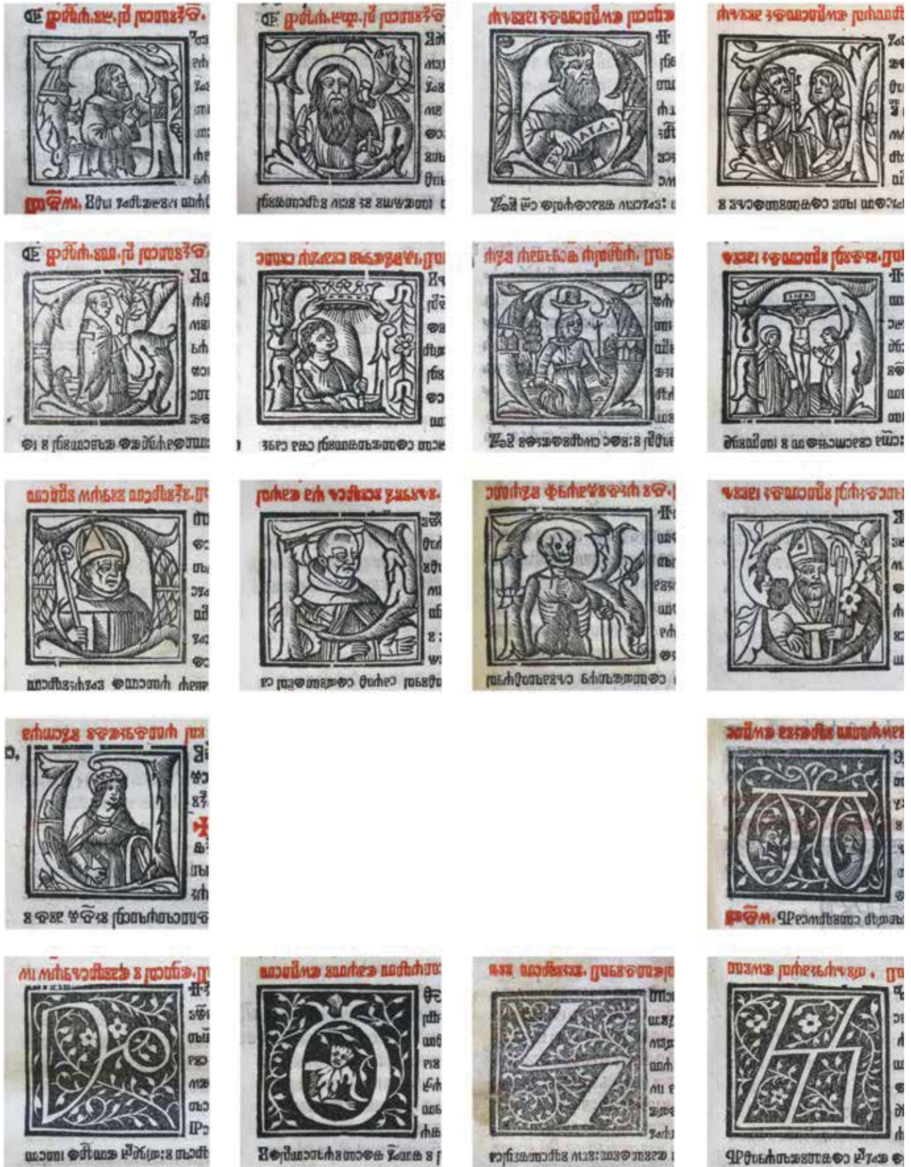
10 a–s. Historiated Latin initials (A, B, D, E, G, L, M, N, O, P, R, S, U) and decorated Glagolitic initials (Ž, Z, I, K, Ê), The Rijeka Missal (Misal hruacki), Rijeka, 1531 Historizirani latinični inicijali (A, B, D, E, G, L, M, N, O, P, R, S, U) i dekorirani glagoljski inicijali (Ž, Z, I, K, Ê), Misal hruacki, Rijeka, 1531.