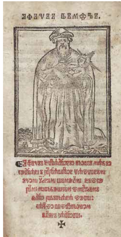
12. Saint Simeon the God-Receiver, The Roman Office , Rijeka, 1530 Sveti Šimun Bogoprimec , Oficij rimski, Rijeka, 1530.

Crucifixion (N), the Dominican martyr Saint Peter (P), and Death as Skeleton (R).