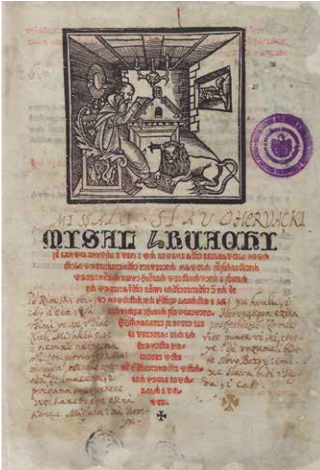
11. Saint Jerome in His Study, The Rijeka Missal ( Misal hruacki ), Rijeka, 1531 Sveti Jeronim u svojoj radnoj sobi , Misal hruacki, Rijeka, 1531.