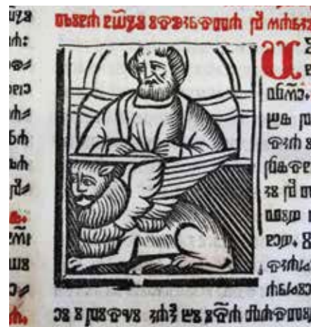
8. Saint Mark the Evangelist, The Rijeka Missal (Misal hruacki) , Rijeka, 1531 Sveti Marko Evandelist, Misal hruacki, Rijeka , 1531.