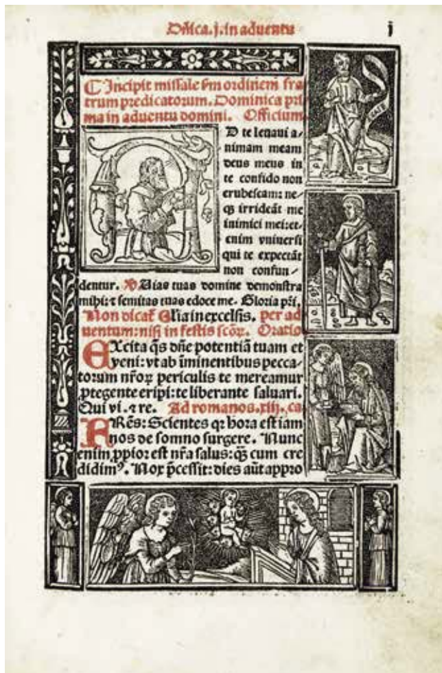
4. Missale predicatorum , Venice, LucAntonio Giunta, 1504 Missale predicatorum, Venecija, LucAntonio Giunta, 1504.