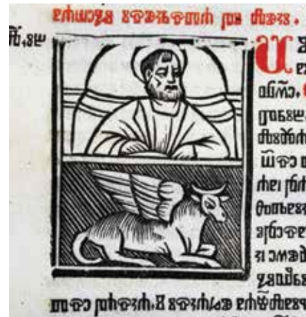
7. Saint Luke the Evangelist, The Rijeka Missal (Misal hruacki) , Rijeka, 1531 Sveti Luka Evandelist, Misal hruacki, Rijeka , 1531.

Finally, the set of 13 historiated Latin initials (Fig. 10) unified by dimensions and used in the Rijeka Missal have their models in several of Giunta’s publications. Since these examples were even in Latin texts used more than once, not specifically relating to the text, identification for some of them is not as specific. The figures in the letters D, G, L, M, O, S, and U seem to depict the general idea of a saint or martyr. Others can be more precisely identified, depicting King David in prayer (A), God the Father (B), Ss. Philip and Jacob (E), the