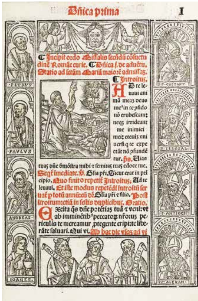
6. Missale Romanum , Venice, Giacomo Penzio, 1521 Missale Romanum, Venecija , Giacomo Penzio, 1521.

begins with the words “Te igitur clementissime pater”, is one of the most fixed places, usually and permanently reserved for the so-called Te-igitur initial, specific for its depictions. While from early on the place of this initial was occupied by the image of Crucified, in the Late Middle Ages, in its place it was also possible to find a depiction of a priest celebrating mass. 25 Nonetheless, the theme from the Rijeka Missal is far away from both of them. In its original context, however, the image of the angel approaching the church explains the iconography – in Giunta’s 1521 Missale Romanum mentioned above, this initial was used as the introduction to the Mass of the Consecration of the Church.