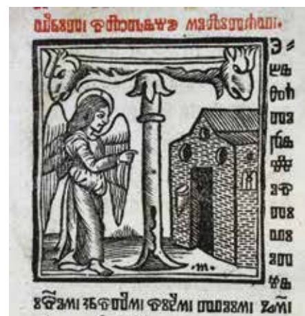
9. Historiated initial T, The Rijeka Missal (Misal hruacki) , Rijeka, 1531 Historizirani inicijal T , Misal hruacki, Rijeka , 1531 .