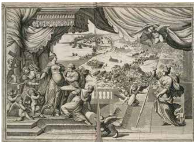
13. Frontispiece of Vincenzo Coronelli's Corso geografico universale , Venice, 1692

Frontispis knjige Vincenza Coronellija Corso geografico universale, Venecija, 1692.