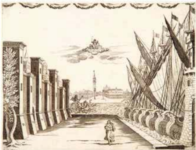
7. Giovanni Giorgi after Giacomo Torelli, stage setting for the opera Bellerofonte , 1642 Giovanni Giorgi prema Giacomu Torelliju, scenografija za operu Bellerofonte , 1642.