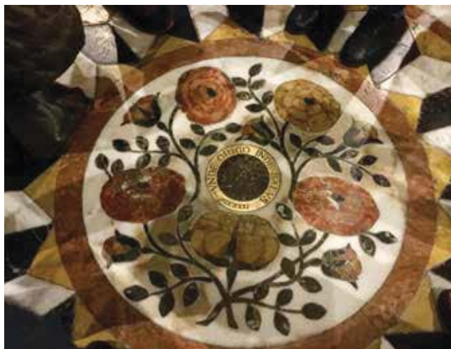
8. Santa Maria della Salute, Venice, inscription on the floor at the center of the church Santa Maria della Salute, Venecija, natpis na podu u središtu crkve