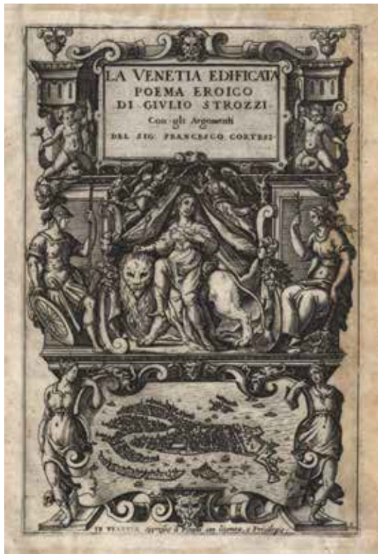
3. Giulio Strozzi, La Venetia edificata (...), 1624, title page Giulio Strozzi, La Venetia edificata (...), 1624., naslovnica