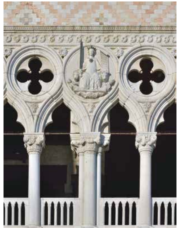
2. Palazzo ducale, Venice, tondo with the allegorical representation of Venice

Francesco Sansovino, Venetia città nobilissima et singolare (...), 1580., naslovnica