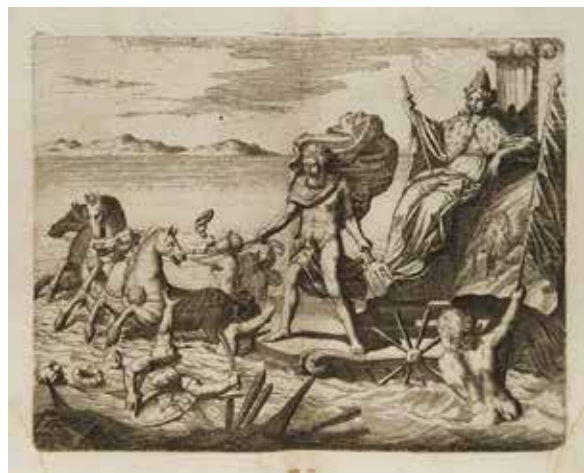
14. Frontispiece of Vincenzo Coronelli's Memorie istoriografiche de' Regni della Morea, Negroponte e littorali fin'a Salonichi , Venice, 1686

Frontispis knjige Vincenza Coronellija Corso geografico universale, Venecija, 1692.