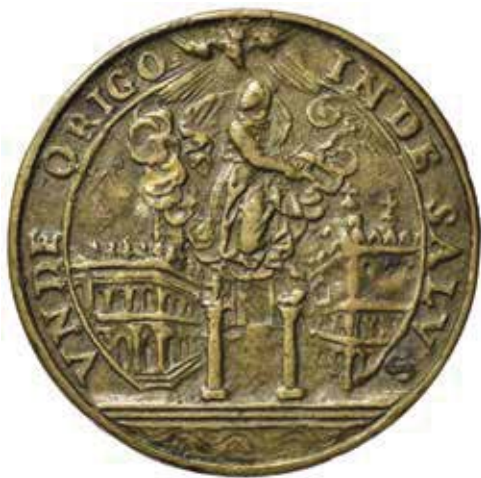
9. Commemorative medal for the foundation of Santa Maria della Salute, recto, 1631 Komemorativna medalja povodom početka gradnje crkve Santa Maria della Salute, recto, 1631.

Sansovino’s title page features an editorial vignette with an allegorical representation of Venice. This allegory dates back to the Middle Ages and, more precisely, to a sculpture from around 1350, attributed to Filippo Calendario, placed on the façade of the Doge’s Palace overlooking the Piazzetta . 11 The sculpture represents a crowned female figure sitting on a throne (the throne of Salomon with the two lions). Her