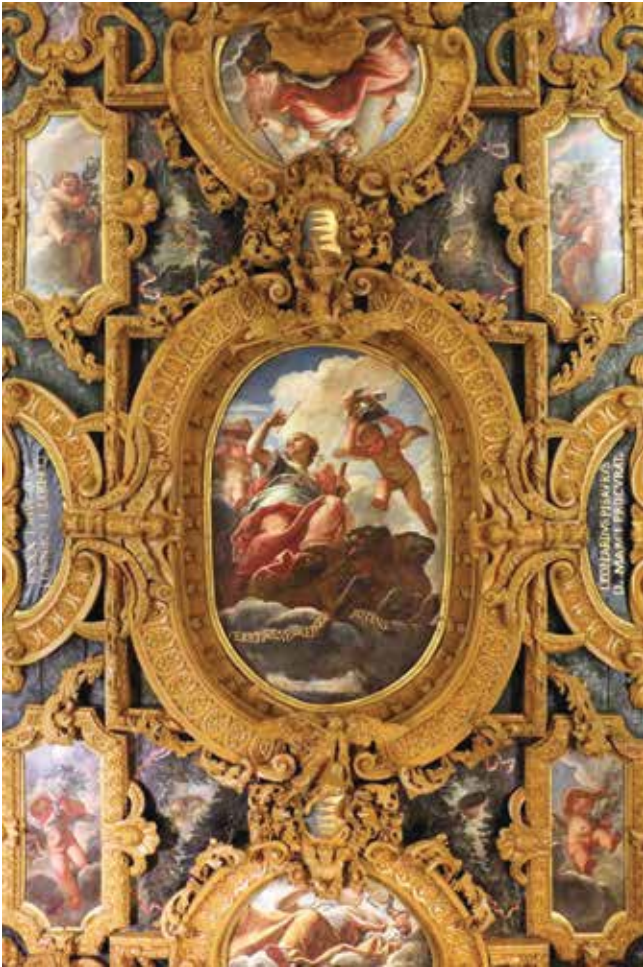
15. Nicolò Bambini, Allegory of Venice , Palazzo Pesaro, Venice, 1682 Nicolò Bambini, Alegorija Venecije, Palača Pesaro, Venecija, 1682.

in February 1670. On the 21 st of November, on the day of the holy day of the Madonna della Salute, the icon was installed on the altar. Therefore, in a kind of narrative sequence, the high altar reflects the negative conclusion of the Cretan War in 1669, while the sculpture at the top of the lantern refers to the fortunate campaigns that Francesco Morosini, the donor of the icon, was conducting in Morea at the time.