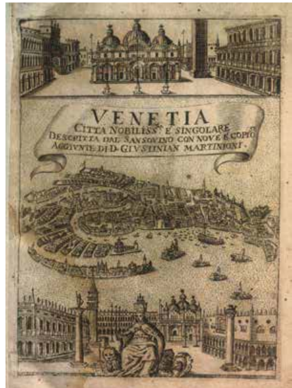
4. Francesco Sansovino – Giustiniano Martinioni, Venetia città nobilissima e singolare (...), 1663, frontispiece Francesco Sansovino – Giustiniano Martinioni, Venetia città nobilissima e singolare (...), 1663., frontispis