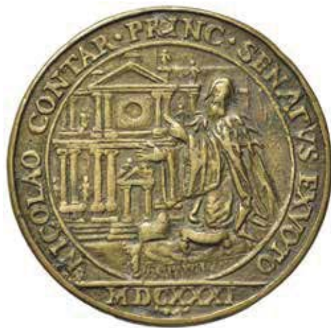
10. Commemorative medal for the foundation of Santa Maria della Salute, verso, 1631 Komemorativna medalja povodom početka gradnje crkve Santa Maria della Salute, verso, 1631.