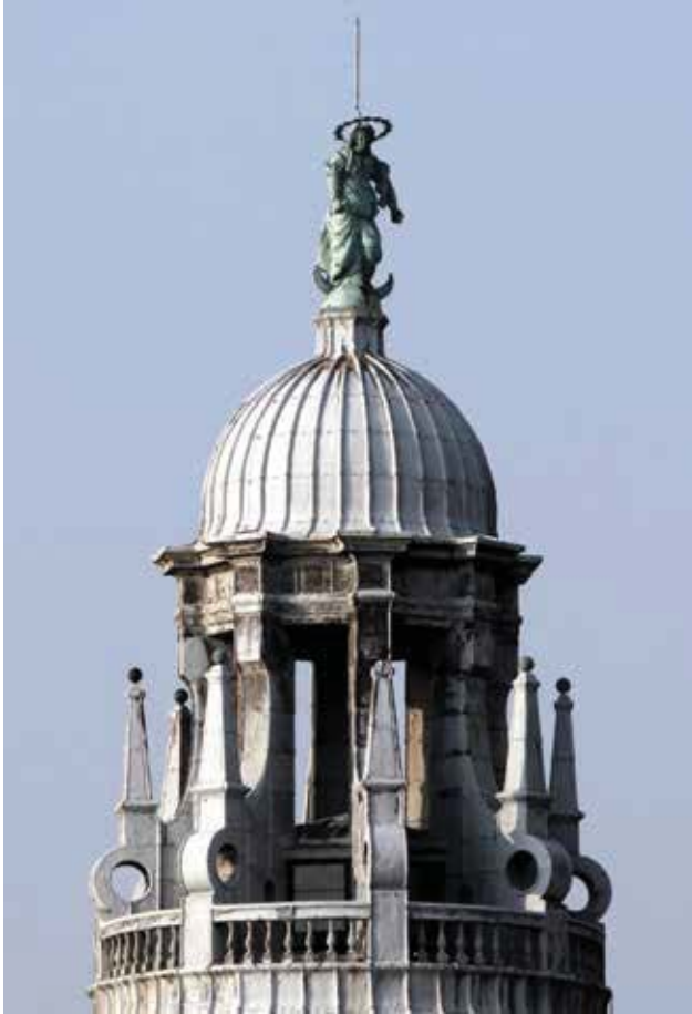
11. Santa Maria della Salute, Venice, lantern Santa Maria della Salute, Venecija, lanterna

attributes are a scroll and a sword. Historians have often underlined that the figure not only refers to Justice but also to the Virgin Mary, 12 as do many other allegorical representations of Venice from the 15 th and 16 th centuries, such as the one by Jacobello da Fiore (1421), 13 where the central figure is flanked by the archangels Gabriel and Michael, or that of Bartolomeo Bon at the top of the Porta della Carta, the entrance to the Doge's Palace (1443). 14 The mid-15 th -century medal of the doge Francesco Foscari, the first in a long series of ducal medals, also makes an explicit reference to the tondo from the Doge's palace: it features a crowned Venezia Magna holding a sword and an escutcheon and sitting on the Salomonic throne. 15